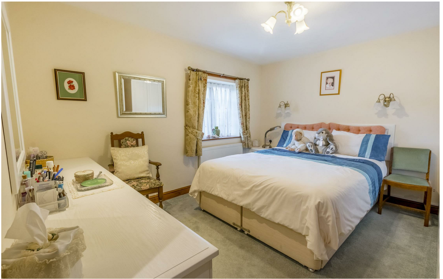
A UNIQUE TWO DOUBLE BEDROOM DETACHED BUNGALOW BEING SOLD WITH THE BENEFIT OF NO UPWARD CHAIN.

Robert Ellis are delighted to offer for sale a unique bungalow which must be viewed internally to fully appreciate the size of the accommodation on offer as its very deceiving from the outside. The property boasts character throughout with modern fittings, in particular the lounge which has high ceilings with beams and solid wood double glazed windows throughout and cottage style internal doors. The master bedroom also benefits from a large en-suite shower room with ample storage space. The property is situated in the heart of the retirement village which has lots of open parkland space to the front and is being sold with the benefit of no upward chain and we strongly recommend all interested parties do take a full inspection so they are able to see the size of the accommodation for themselves and get a feel of the lovely grounds that surround the properties within the development.